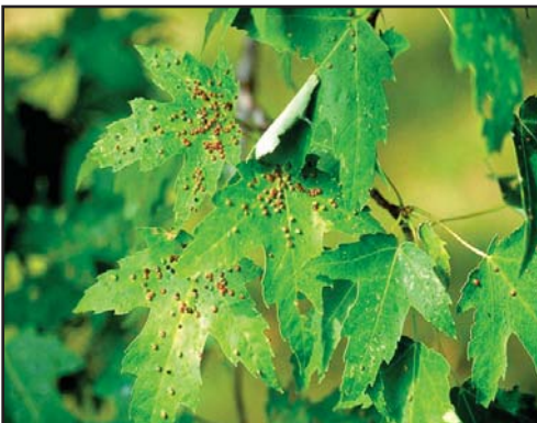
Bladder gall on maple, a disfiguring but minor disease