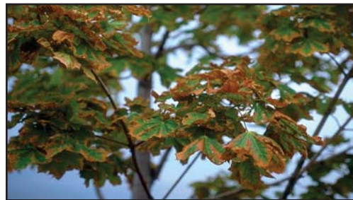
Salt damage on sugar maple